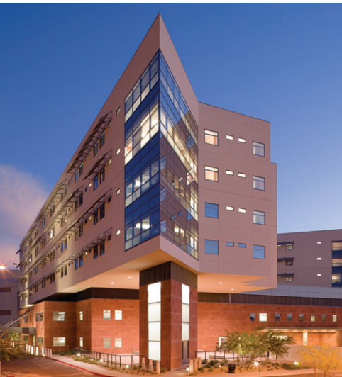
Barrow Neurological Institute, Phoenix, AZ, USA

During the course, there will be two operating rooms live streamed each day. Dr. Lawton will discuss the cases and present microsurgical videos after each operation. The operative schedule will highlight the application of aneurysm clips.