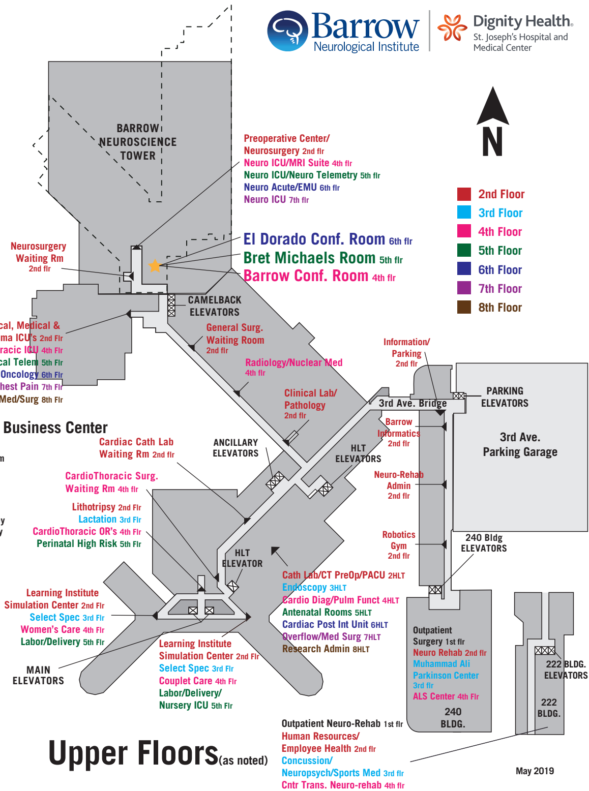
Upper Floors (as noted)