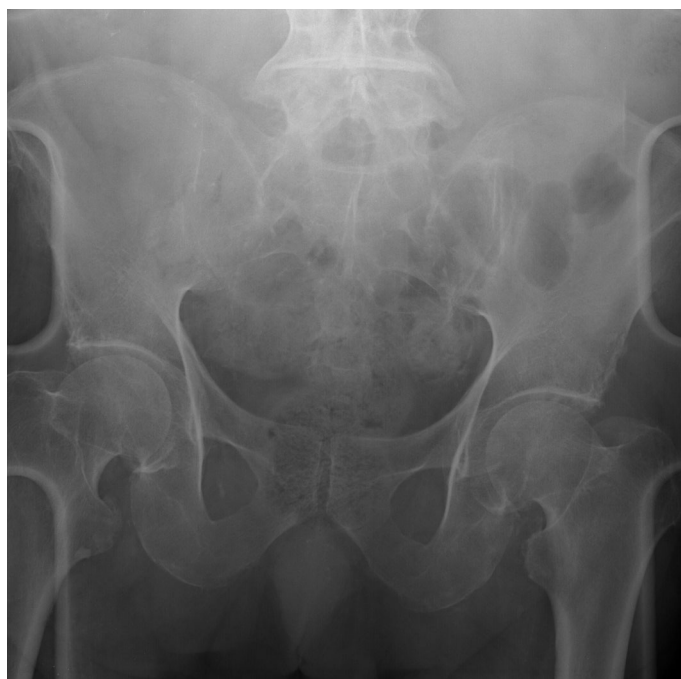
Figure 3. Anteroposterior x-ray of the pelvis shows no evidence of fusion, erosion, or sclerosis of the sacroiliac joint.

Specifically, CT of the cervical spine showed about 3 mm of retrolisthesis of C3 on C4 (Fig. 1). CT of the thoracic spine showed multilevel fusion and satisfactory alignment of the spine. There was evidence of mild-to-moderate degenerative changes associated with osseous ridging. At the midthoracic levels, the central canal was mildly to moderately narrowed. CT of the lumbar spine showed ossification anterior to the vertebral bodies and satisfactory alignment. Small osteophytes were present at L3-4 and L4-5, as was moderate narrowing of the central canal. Calcifications were also present in the descending aorta and proximal iliac arteries. A tiny calcific density involved the right kidney.