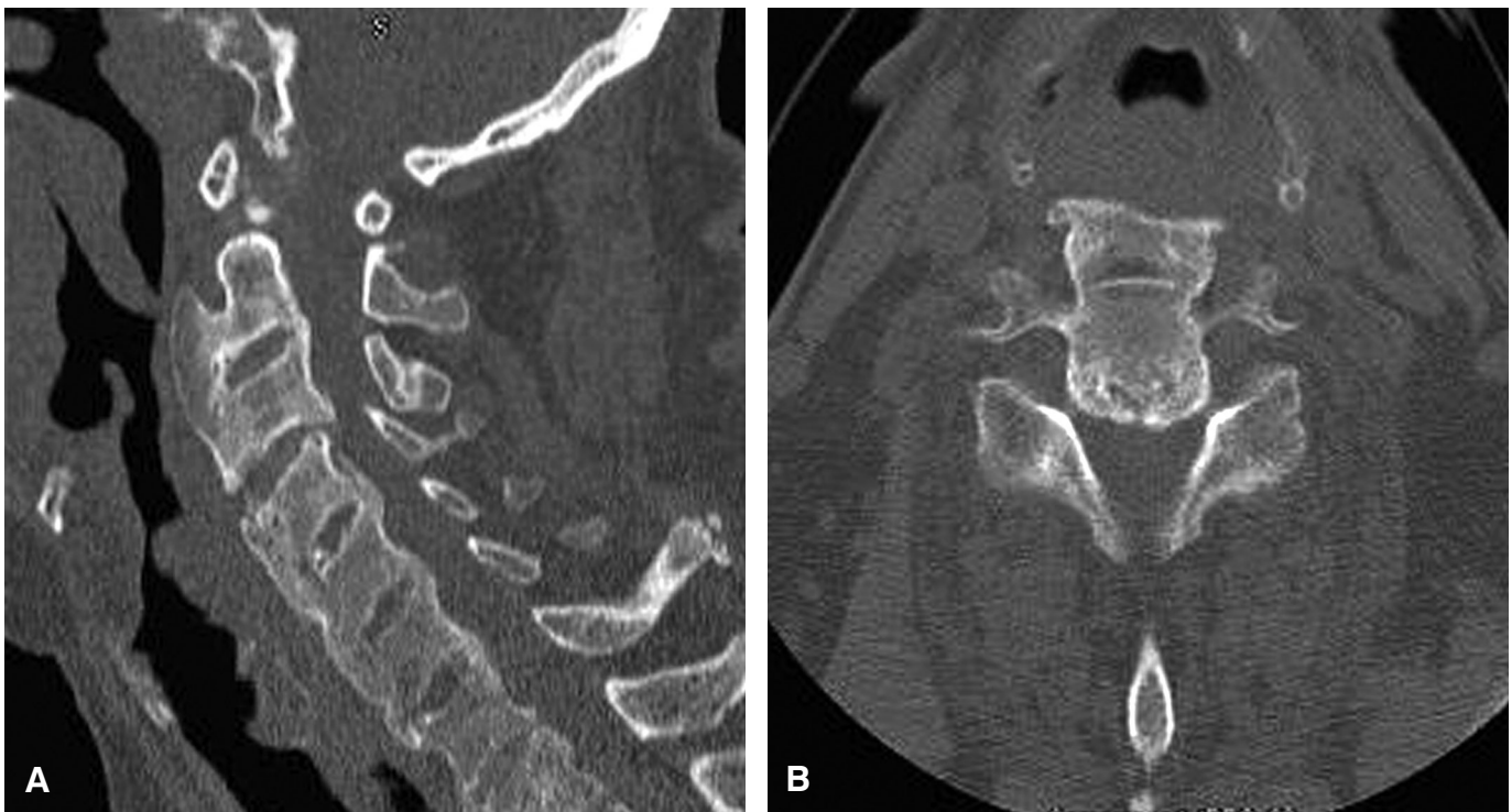
Figure 1. (A) Sagittal and (B) axial CT scans of the cervical spine show either diffuse skeletal hyperostosis or ankylosing spondylitis; both conditions have a similar appearance on CT studies. Ossification of the anterior and posterior longitudinal ligaments is associated with severe osseous ridging along the spine. Hyperostotic changes contribute to the severe stenosis of the spinal canal.

CT of the head showed no intracranial hemorrhage, skull fracture, or extraaxial collections. The size and configuration of the ventricles were normal. As interpreted by the radiologist, CT of the cervical, thoracic, and lumbar spine showed "changes consistent with ankylosing spondylitis" but no acute fractures.