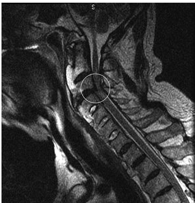
Figure 2. Sagittal T2-weighted MR image of the cervical spine shows a herniated nucleus pulposus at C3-C4 causing a change in the signal intensity of the spinal cord, stenosis of the central canal, and effacement of the ventral cerebrospinal fluid space ( circle ).